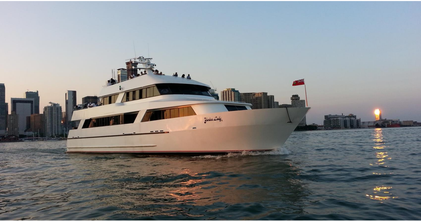
Yankee Lady IV on the Toronto Harbour